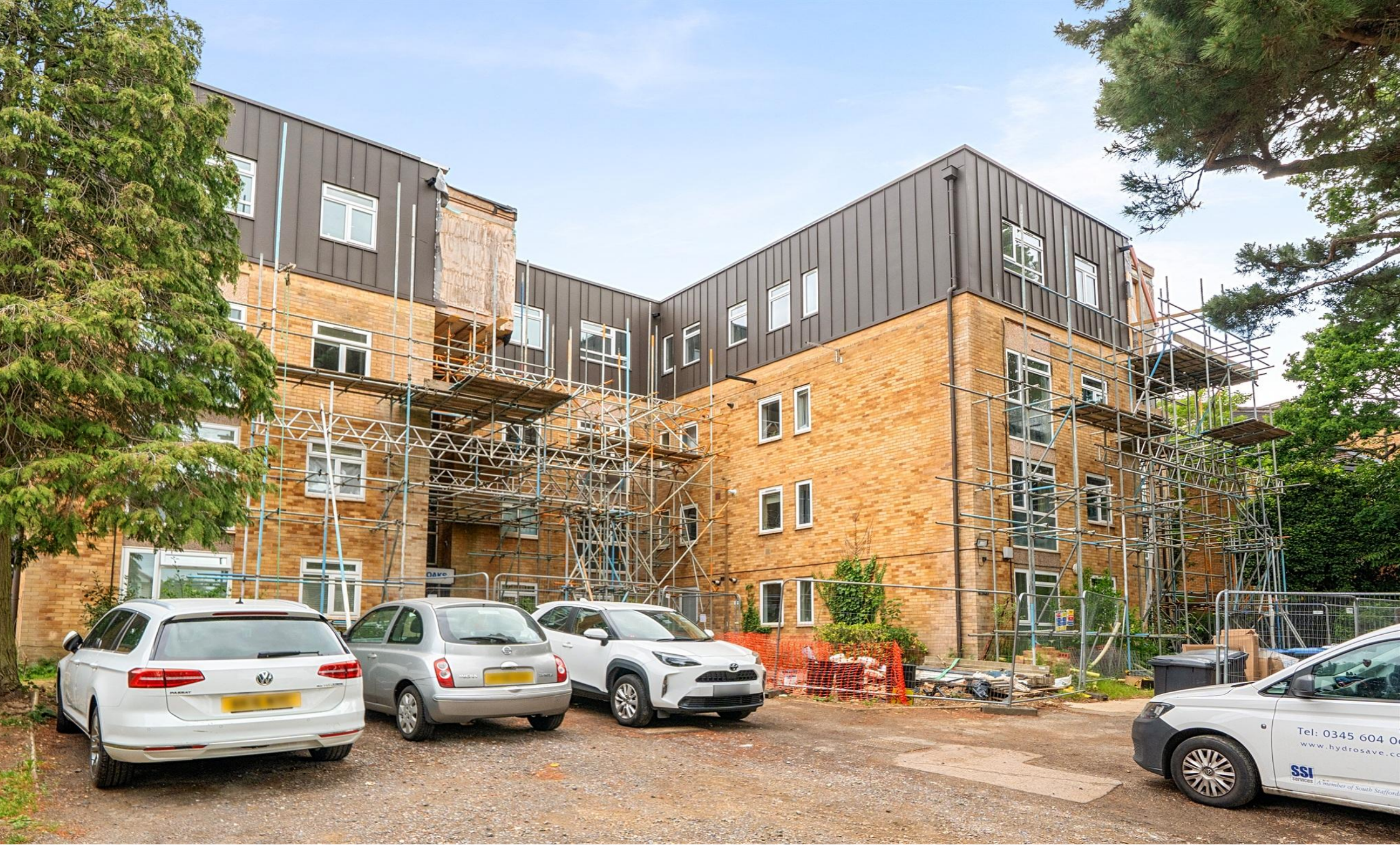
The Oaks, Bycullah Road, Enfield, EN2 8EQ