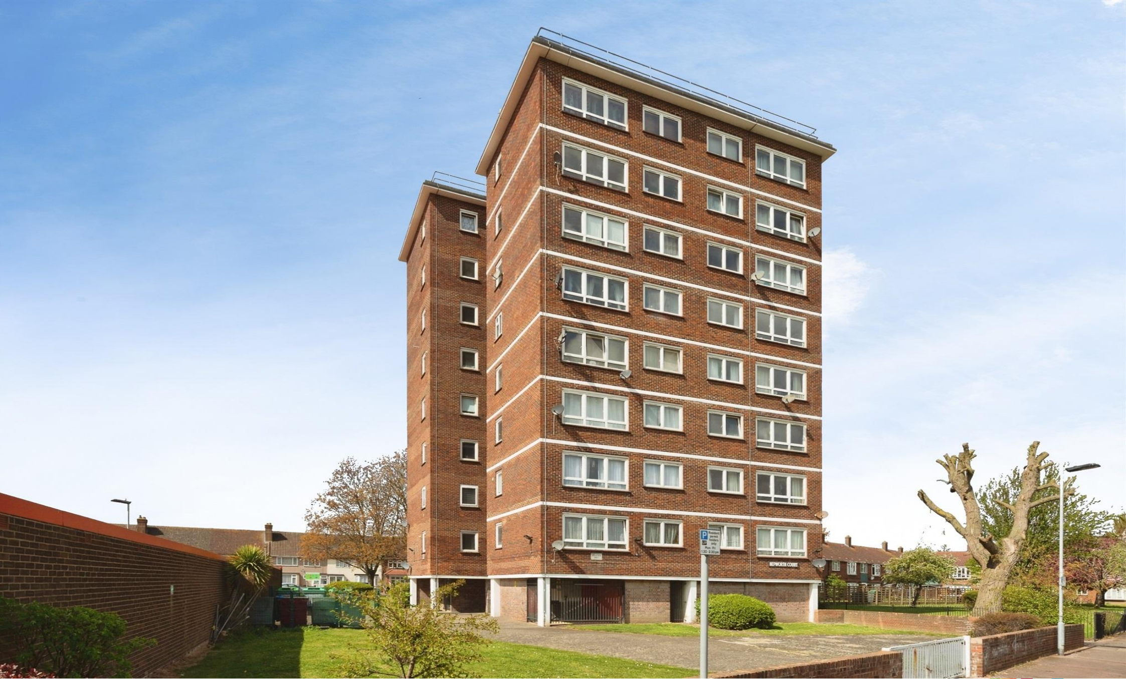
Hepworth Court, Hepworth Gardens, Barking, IG11 9AZ