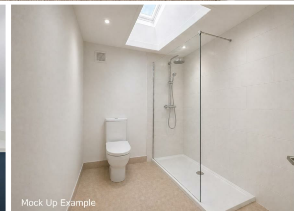
Mock Up Example