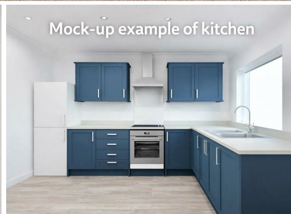
Mock-up example of kitchen