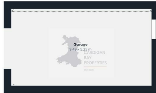
Floor 0 Building 3