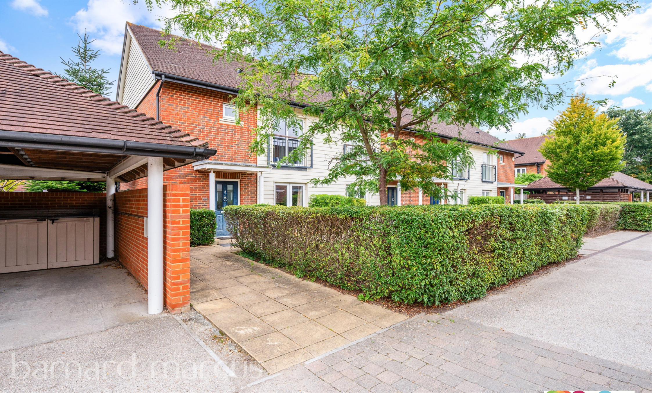
Jeremiah Court, Redhill RH1 2NE