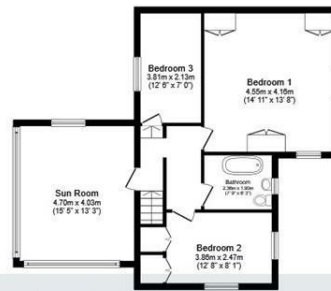
First Floor Floor area 73.4 sq.m. (790 sq.ft.)