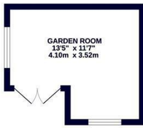
OUTBUILDING 135 sq.ft. (12.5 sq.m.) approx.