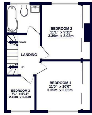
1ST FLOOR 353 sq.ft. (32.8 sq.m.) approx.