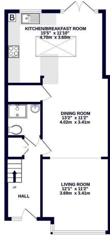
GROUND FLOOR 584 sq.ft. (54.2 sq.m.) approx.