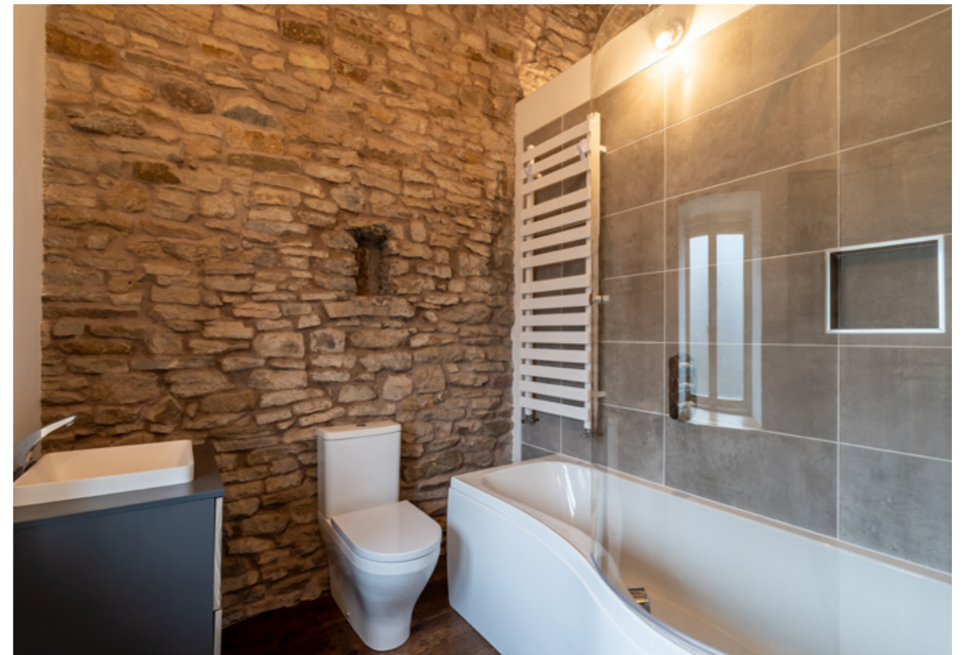
BEDROOM 2 EN-SUITE BATHROOM