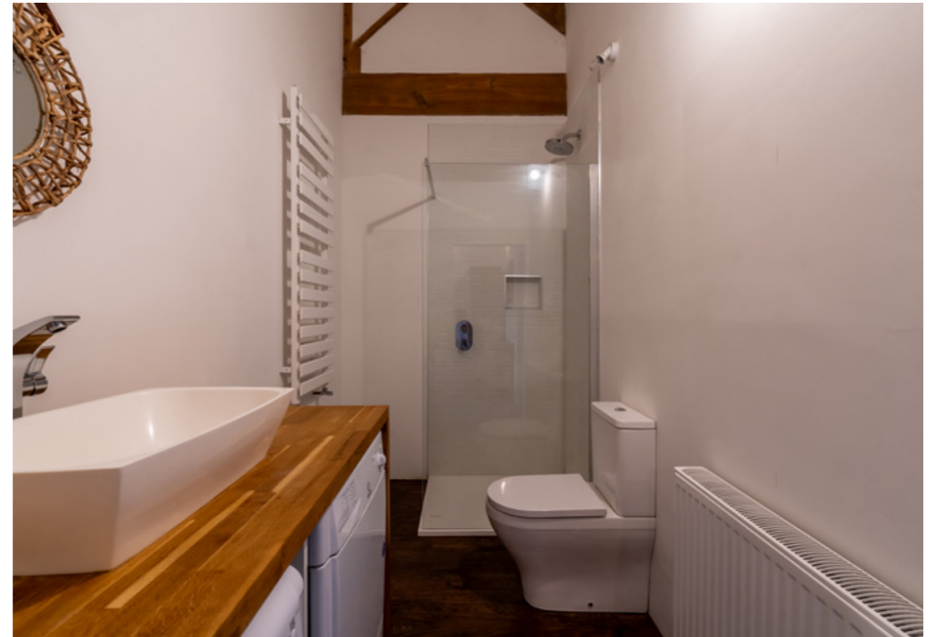
BEDROOM 3 EN-SUITE SHOWER ROOM