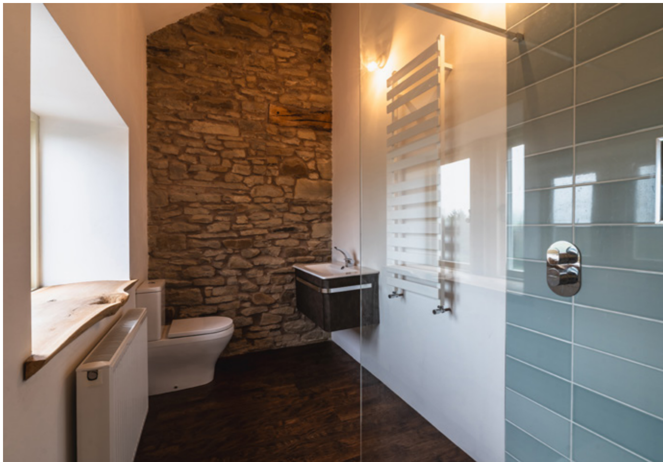
BEDROOM 4 EN-SUITE SHOWER ROOM