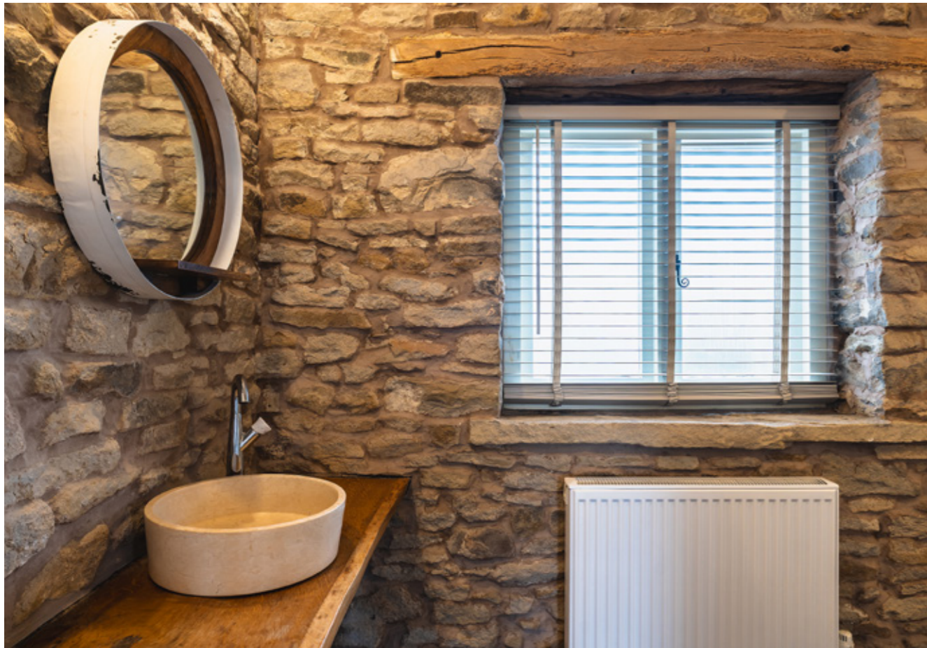
MASTER EN-SUITE SHOWER ROOM