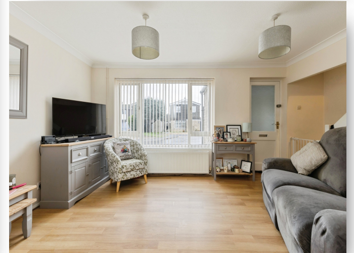
Ashleigh Gardens, Wymondham NR18 0EX