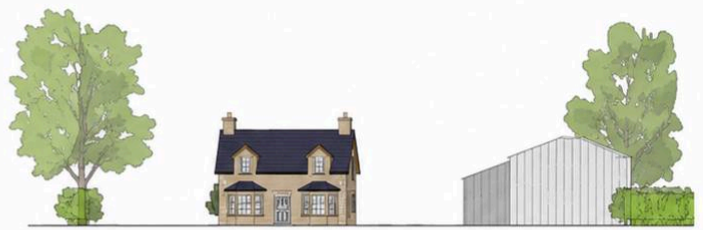
2 Site Section - Proposed 1 : 200