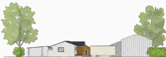
1 Site Section - Existing 1 : 200