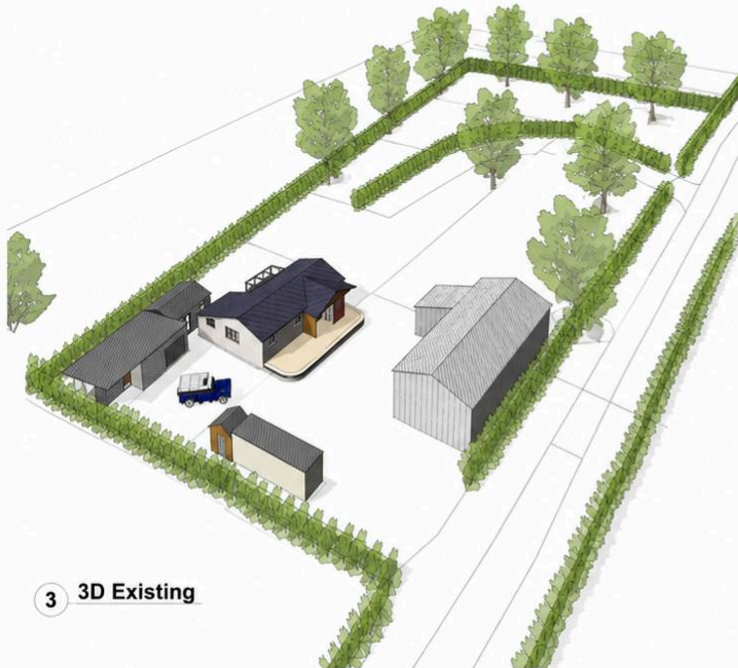
3 3D Existing