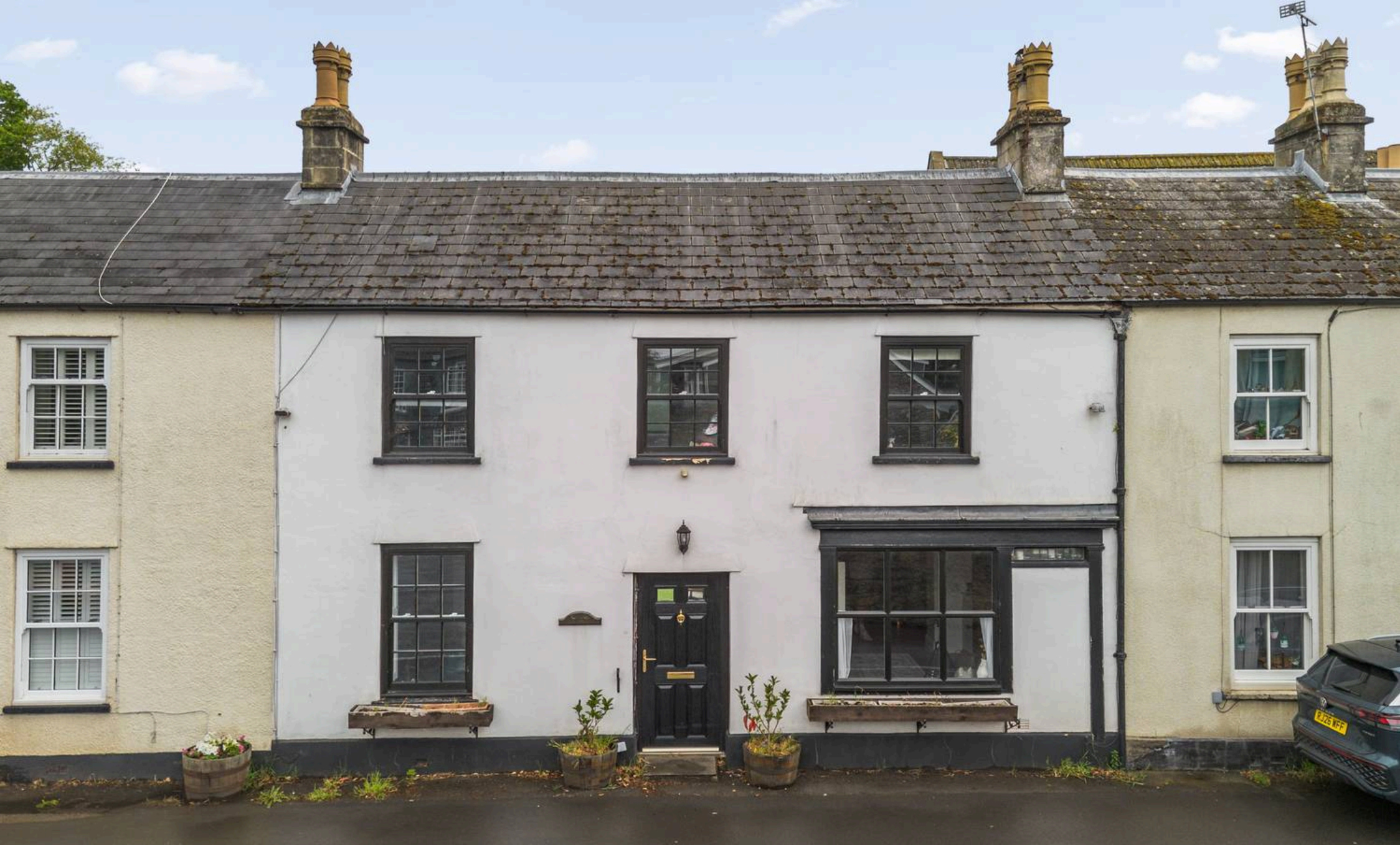
Old Library, High Street, Wroughton - BS40 5QA