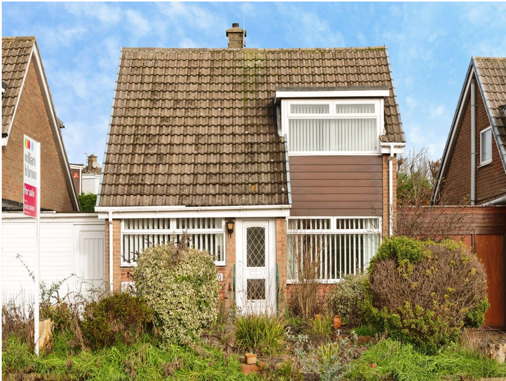
Queensmead, Beverley, HU17 8PQ