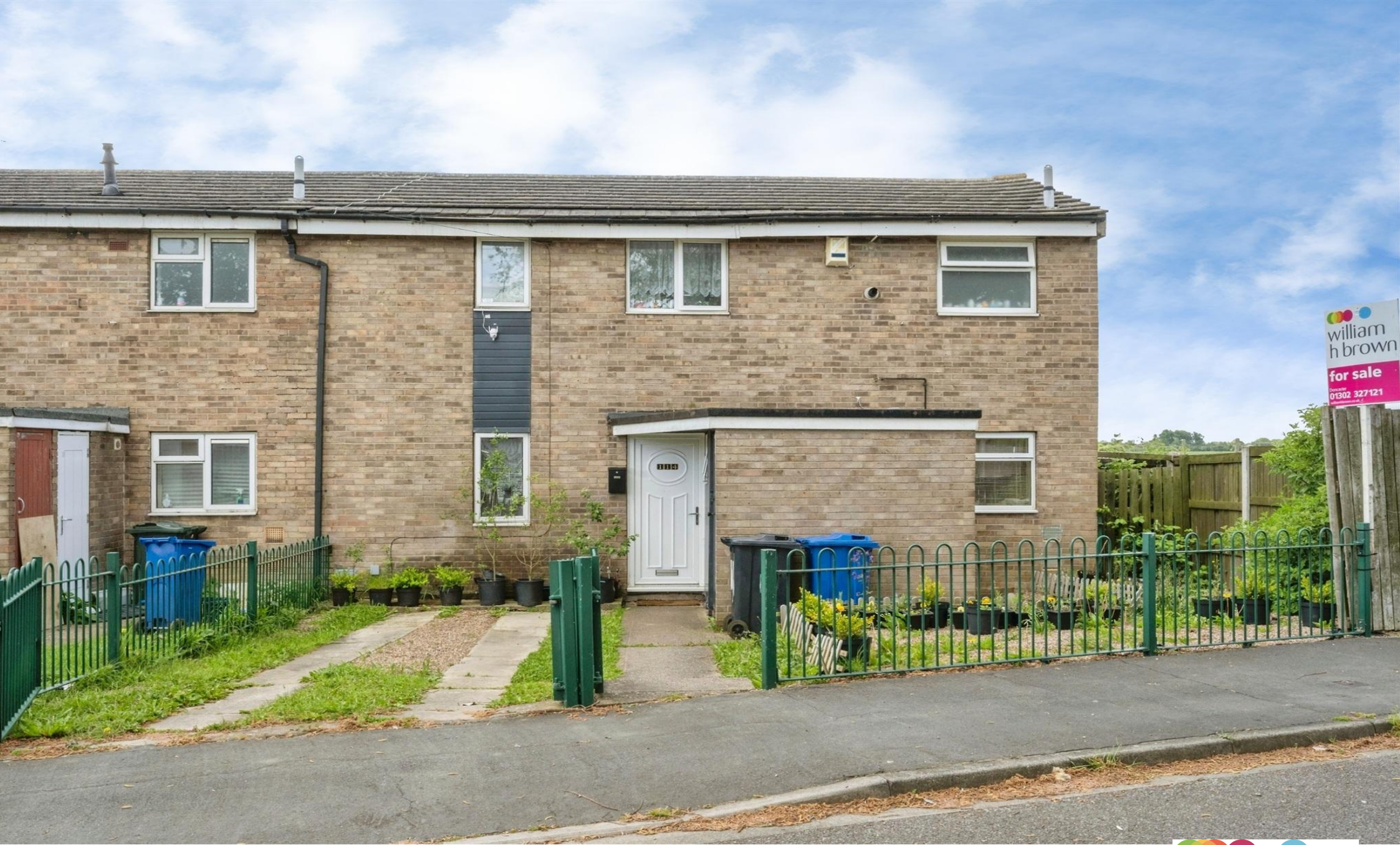
Manor Estate, Toll Bar Doncaster