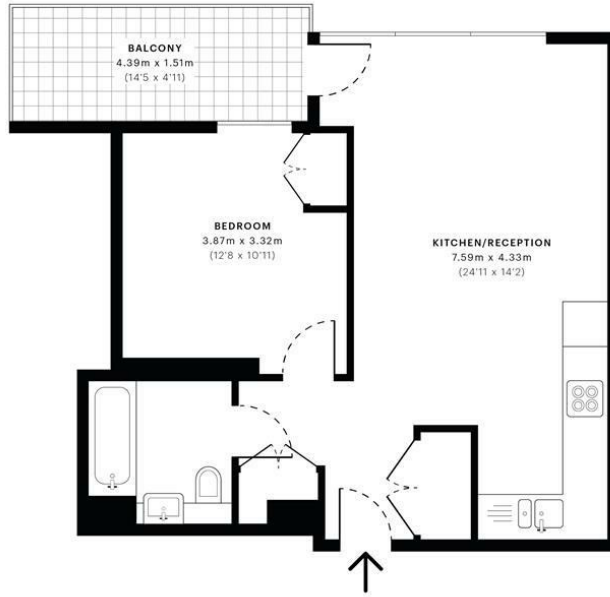
- Fourteenth Floor