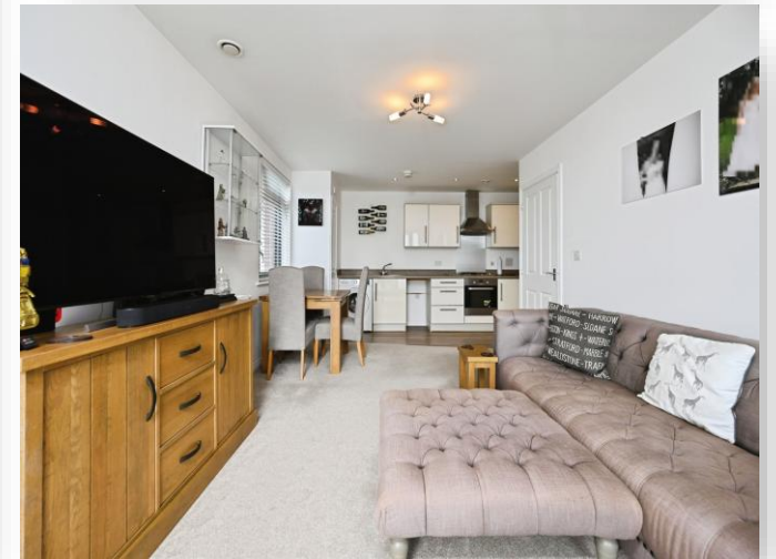
Ark Royal House, Blanchard Avenue, Gosport, PO13 8NR