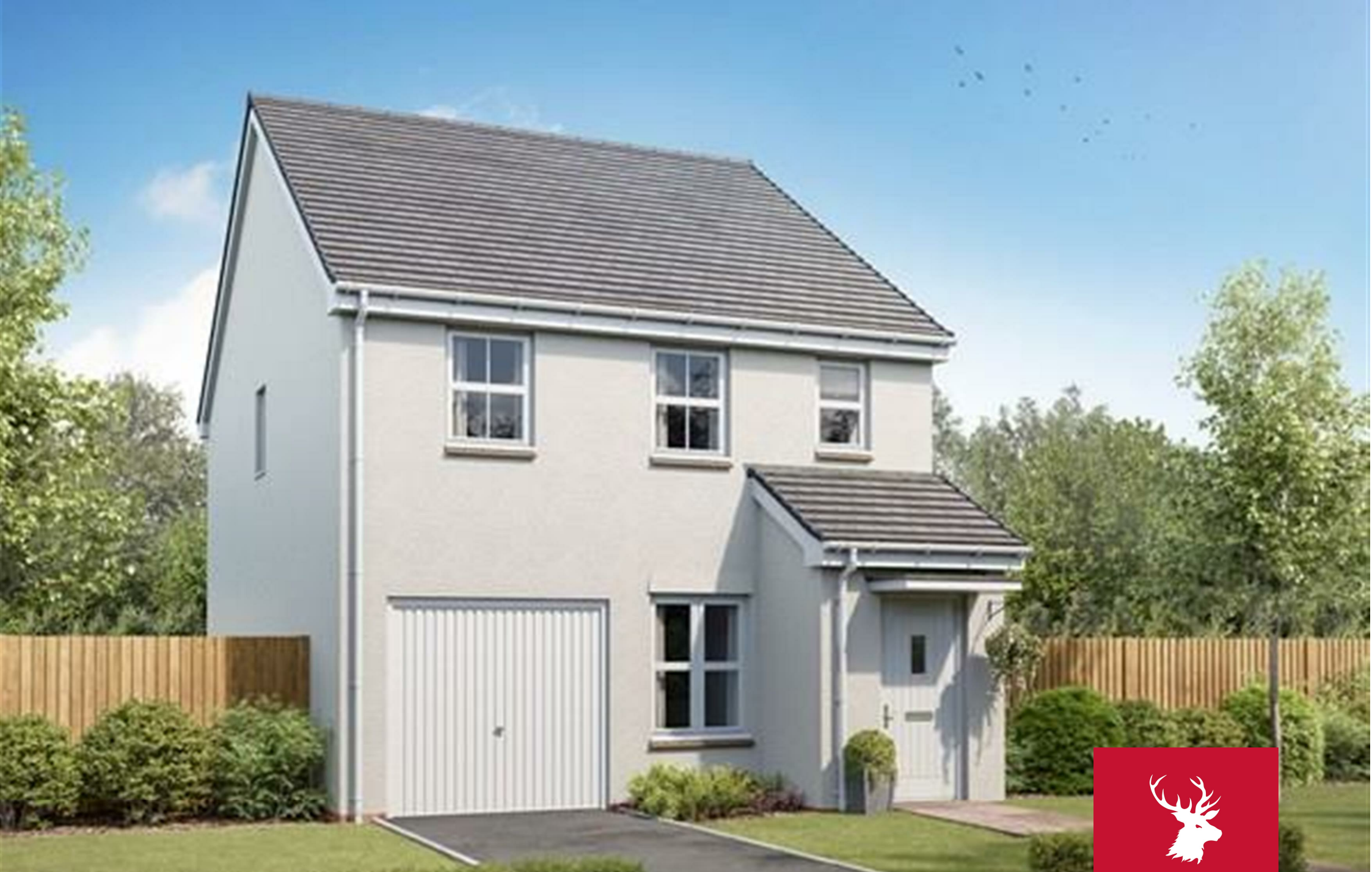
The Glenmore, Plot 151