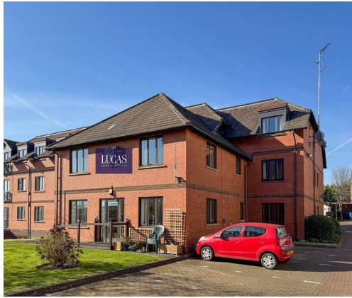
FIRST FLOOR APARTMENT 562 sq.ft. (52.2 sq.m.) approx

TOTAL FLOOR AREA : 562 sq.ft. (52.2 sq.m.) approx. Whilst every attempt has been made to ensure the accuracy of the floorplan contained here, measurements of doors, windows, rooms and any other items are approximate and no responsibility is taken for any error, omission or mis-statement. This plan is for illustrative purposes only and should be used as such by any prospective purchaser. The services, systems and appliances shown have not been tested and no guarantee as to their operability or efficiency can be given. Made with Metropix ©2025