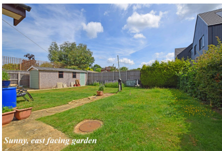
Sunny, east facing garden