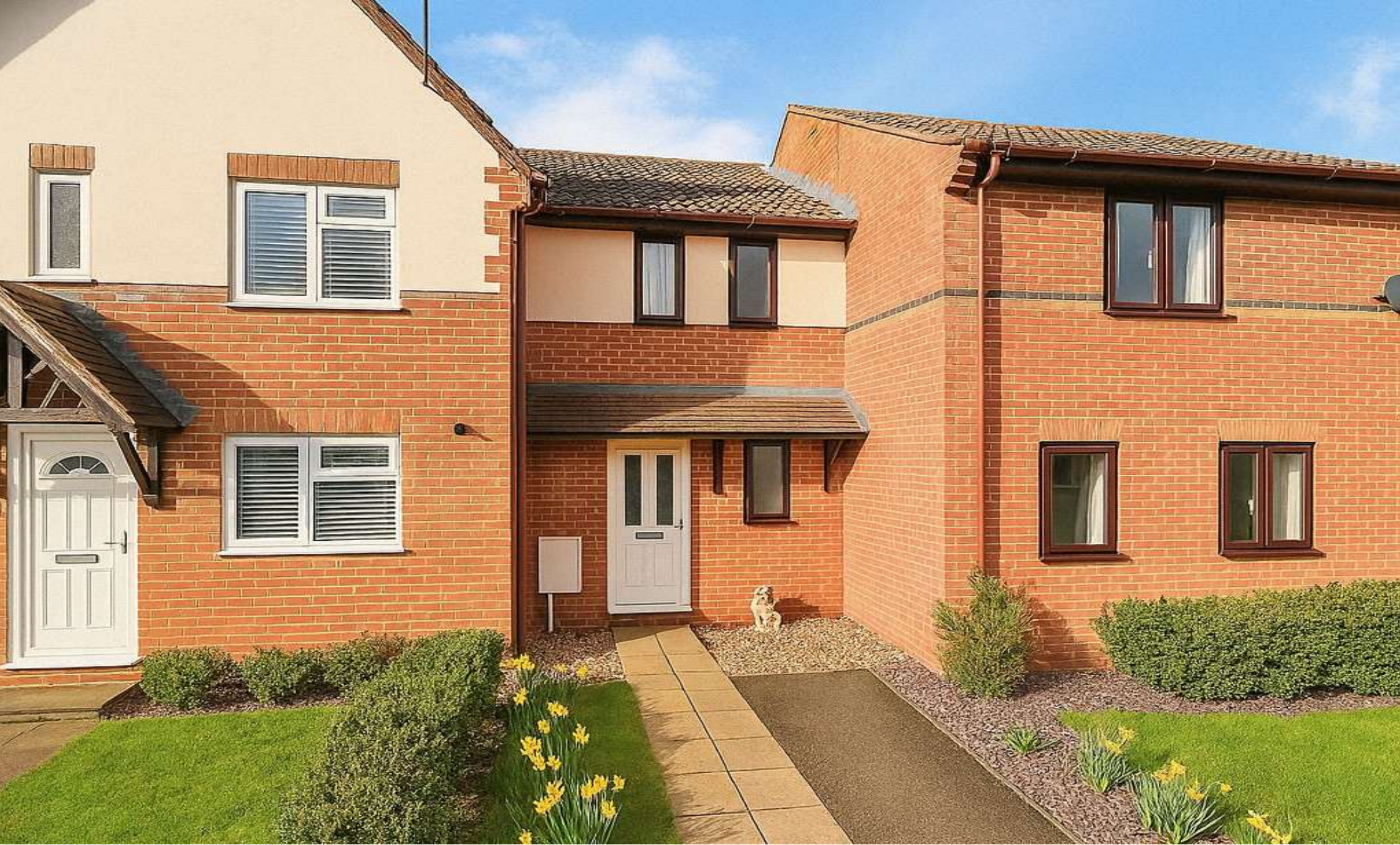
The Belfry, Hailsham BN27 3UG