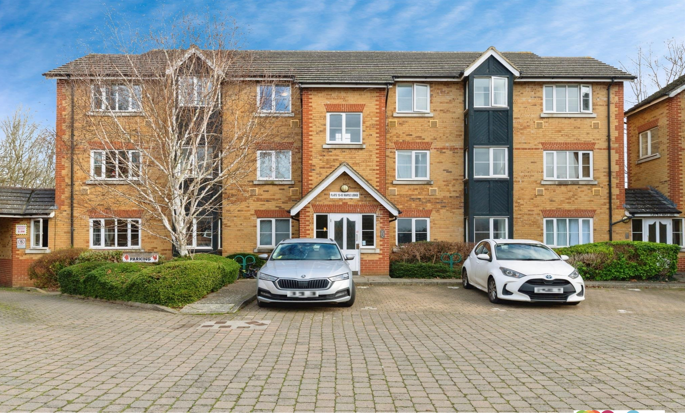
Maple Lodge Riversmeet, Hertford, SG14 1LW