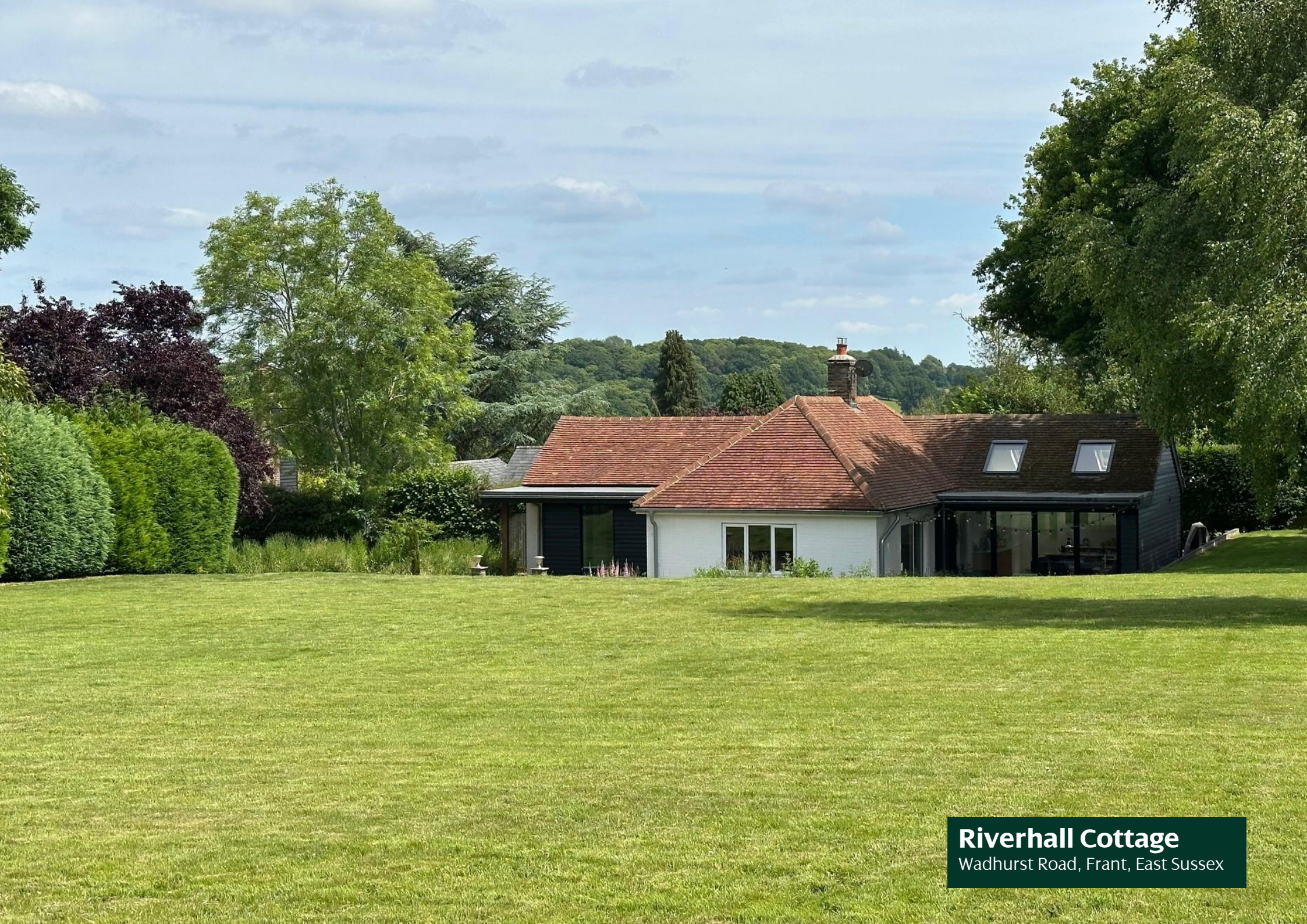
Riverhall Cottage Wadhurst Road, Frant, East Sussex