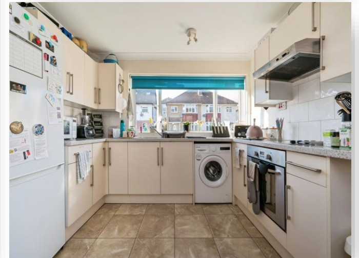
Lawrence Court, Lawrence Grove, Southampton SO19 9QD