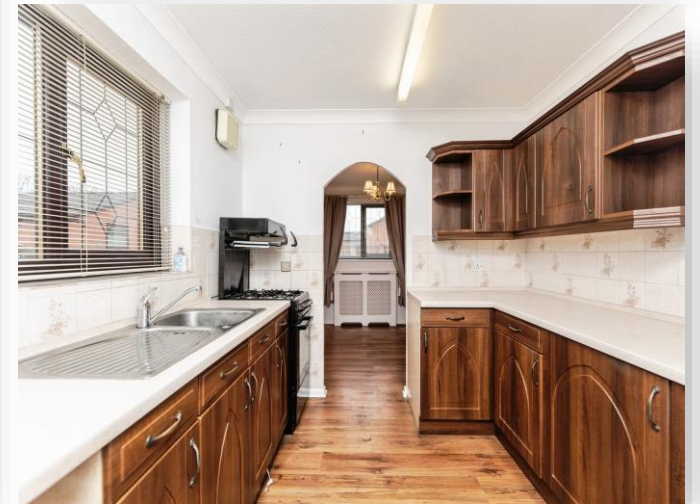
Perth Drive, Tingley Wakefield WF3 1TZ