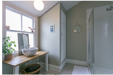
818 sq.ft. (76.0 sq.m.) approx.

IMPORTANT NOTE: These particulars and the descriptions and measurements herein do not constitute representation and whilst every effort has been made to ensure accuracy, this cannot be guaranteed.