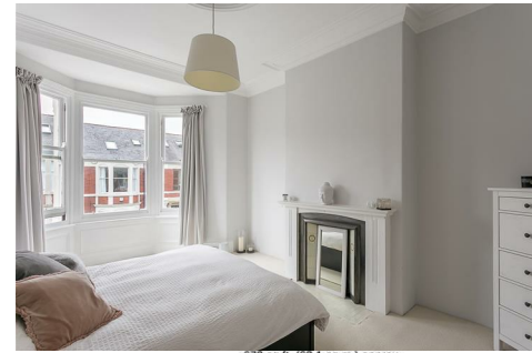
679 sq.ft. (63.1 sq.m.) approx.