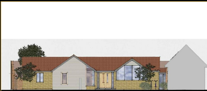
NORTH EAST elevation inside boundary wall

It is understood that mains water is connected. Other services not connected.