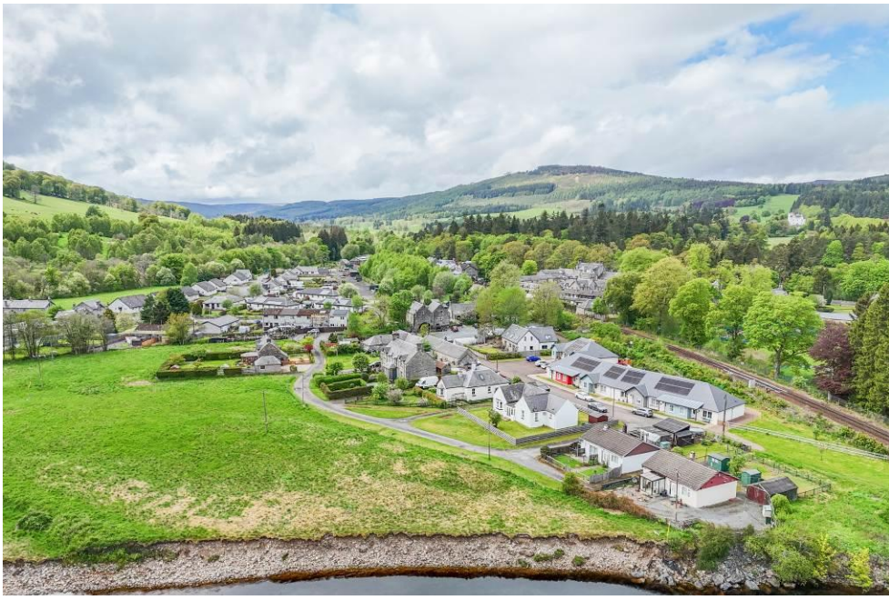
Next Home - Nurses Cottage, Ford Road, Blair Atholl, Pitlochry, PH18 5SH