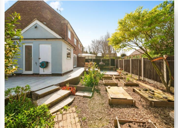
Pasture Road, Wirral CH46 7TQ