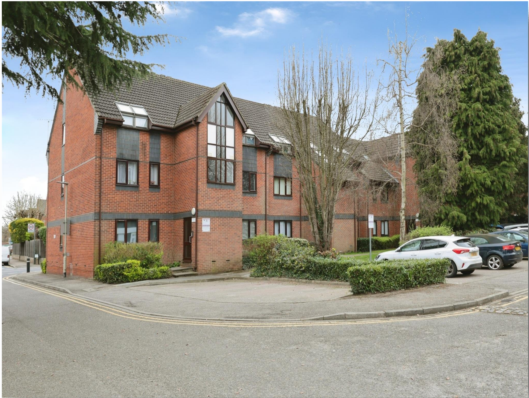
Elton Park, Watford, WD17 4NW