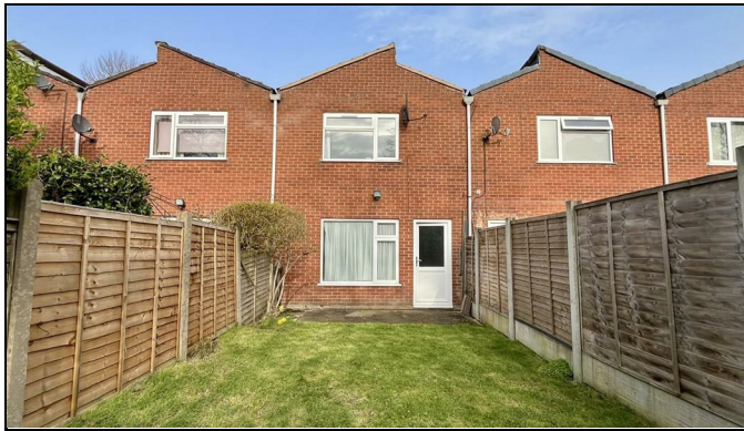
Spiral Green, B24 0TR