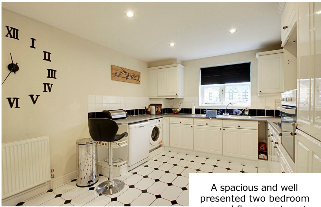
A spacious and well presented two bedroom ground floor apartment overlooking the popular Apsley Marina.