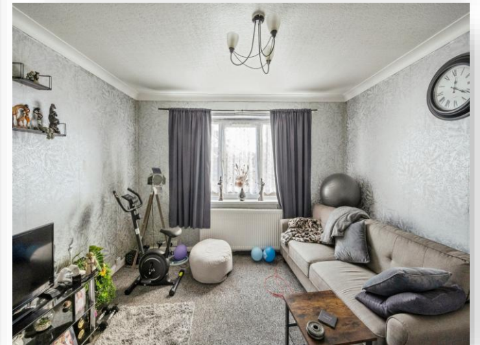
Butcher Street, Thurnscoe Rotherham S63 0RB