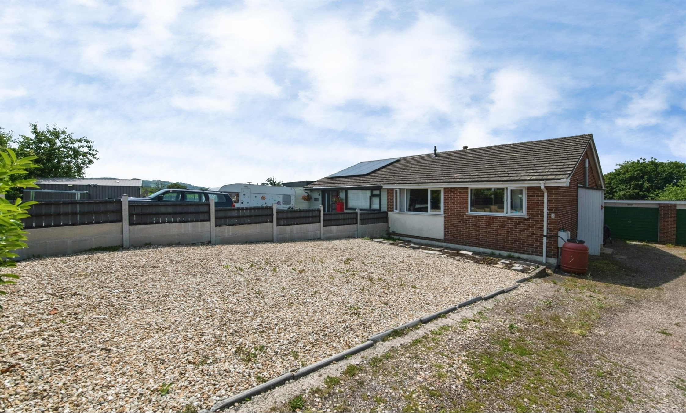
The Bungalows, Woodbury Park, Axminster EX13 5RU