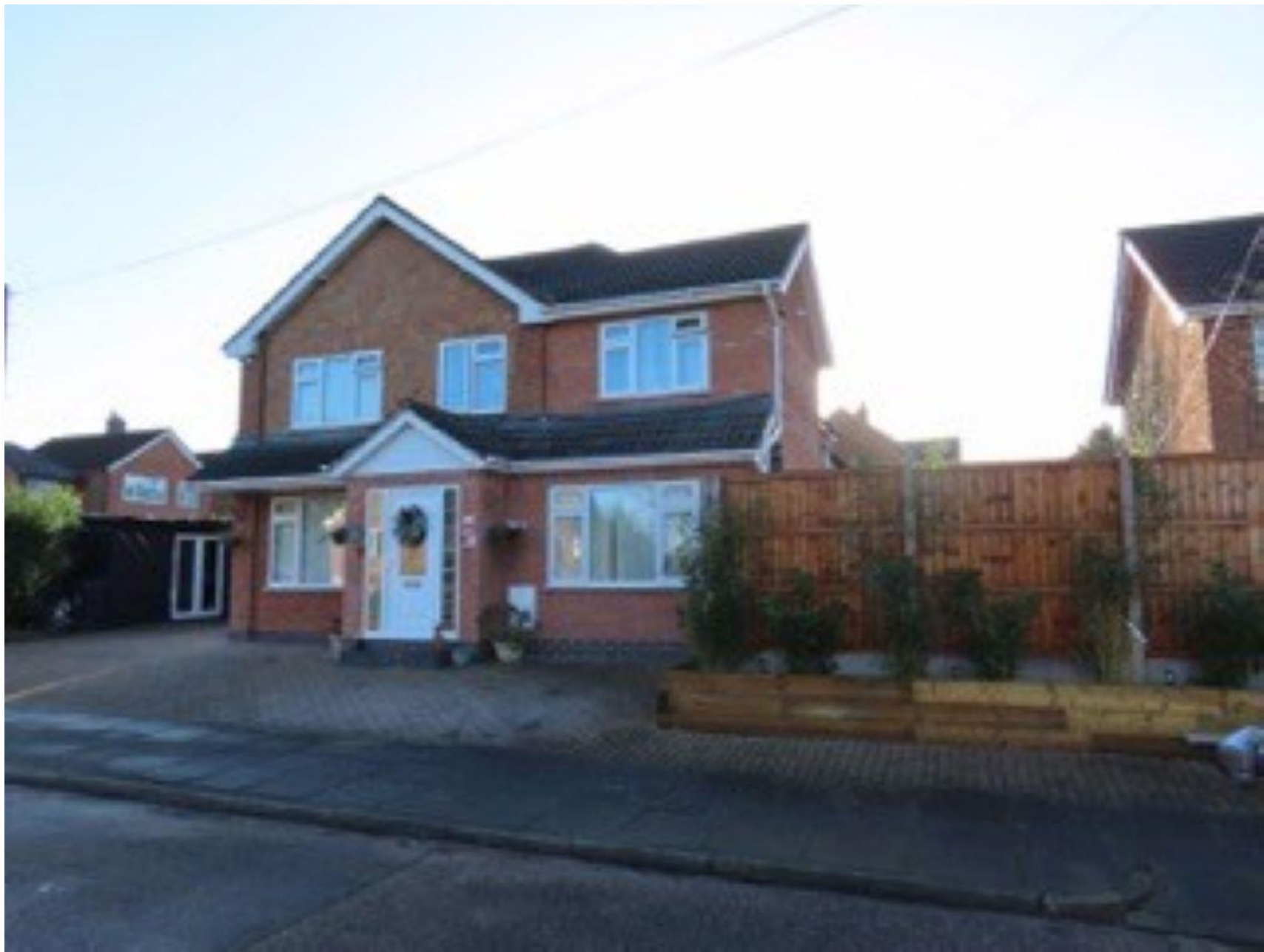
Oakdene Road, LEICESTER LE2 6JL