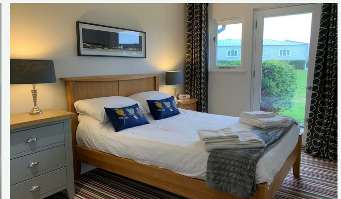
Saltbox B7, The West Bay, Yarmouth, Isle of Wight, PO41 0RJ