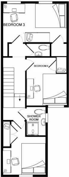
1ST FLOOR APPROX. FLOOR AREA 472 SQ.FT. (43.9 SQ.M.) TOTAL APPROX. FLOOR AREA 960 SQ.FT. (89.2 SQ.M.)

Whilst every attempt has been made to ensure the accuracy of the floor plan contained here, measurements of doors, windows, rooms and any other items are approximate and no responsibility is taken for any error, omission, or mis-statement. This plan is for illustrative purposes only and should be used as such by any prospective purchaser. The services, systems and appliances shown have not been tested and no guarantee as to their operability or efficiency can be given. Made with Metroplan 62018