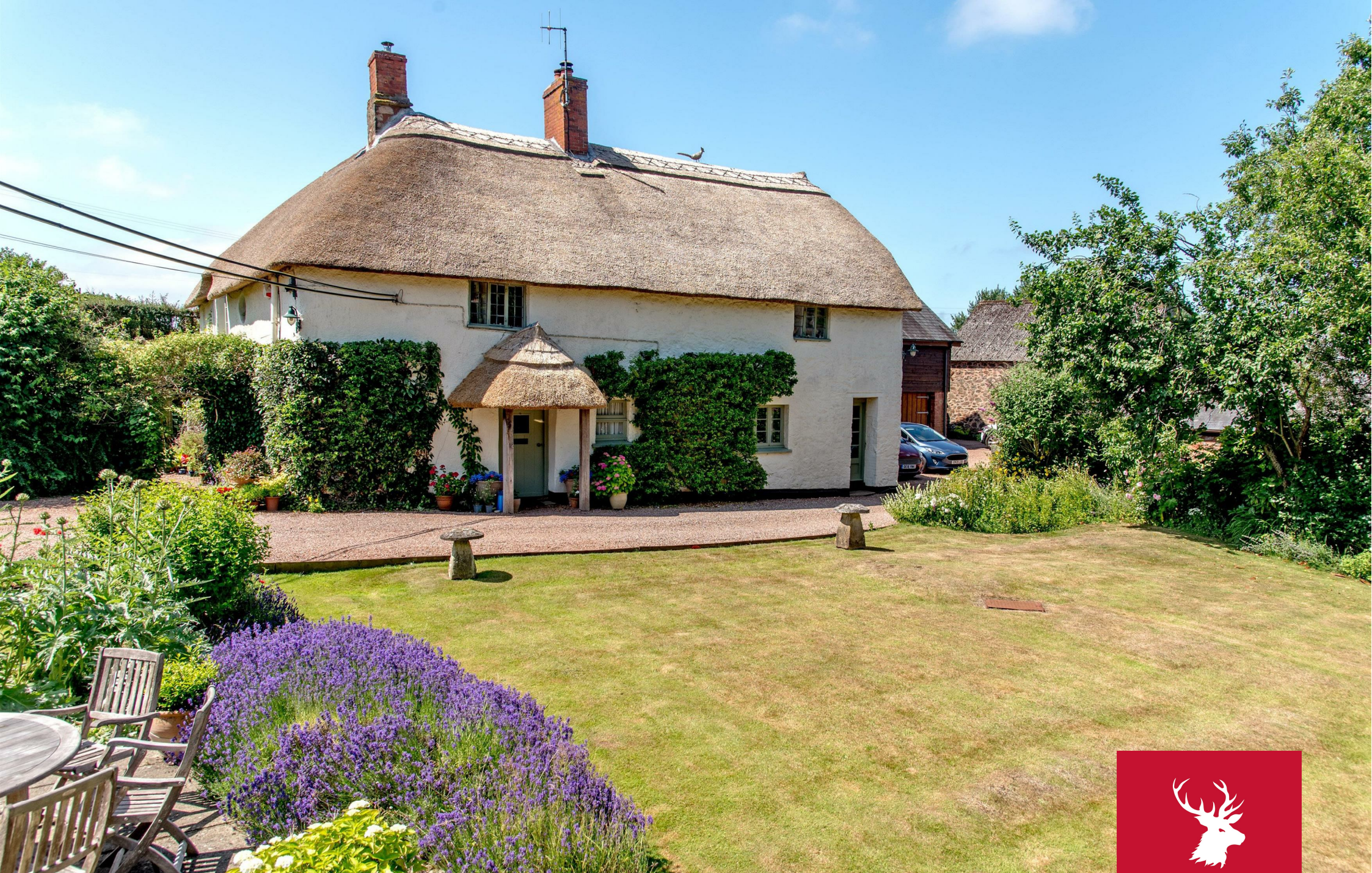
Town End Farm