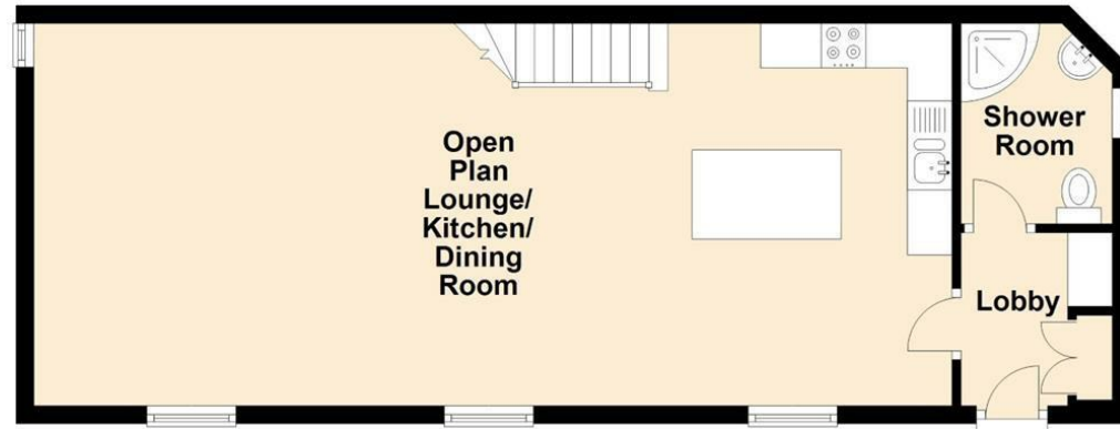
First Floor Approx. 44.2 sq. metres (475.9 sq. feet)