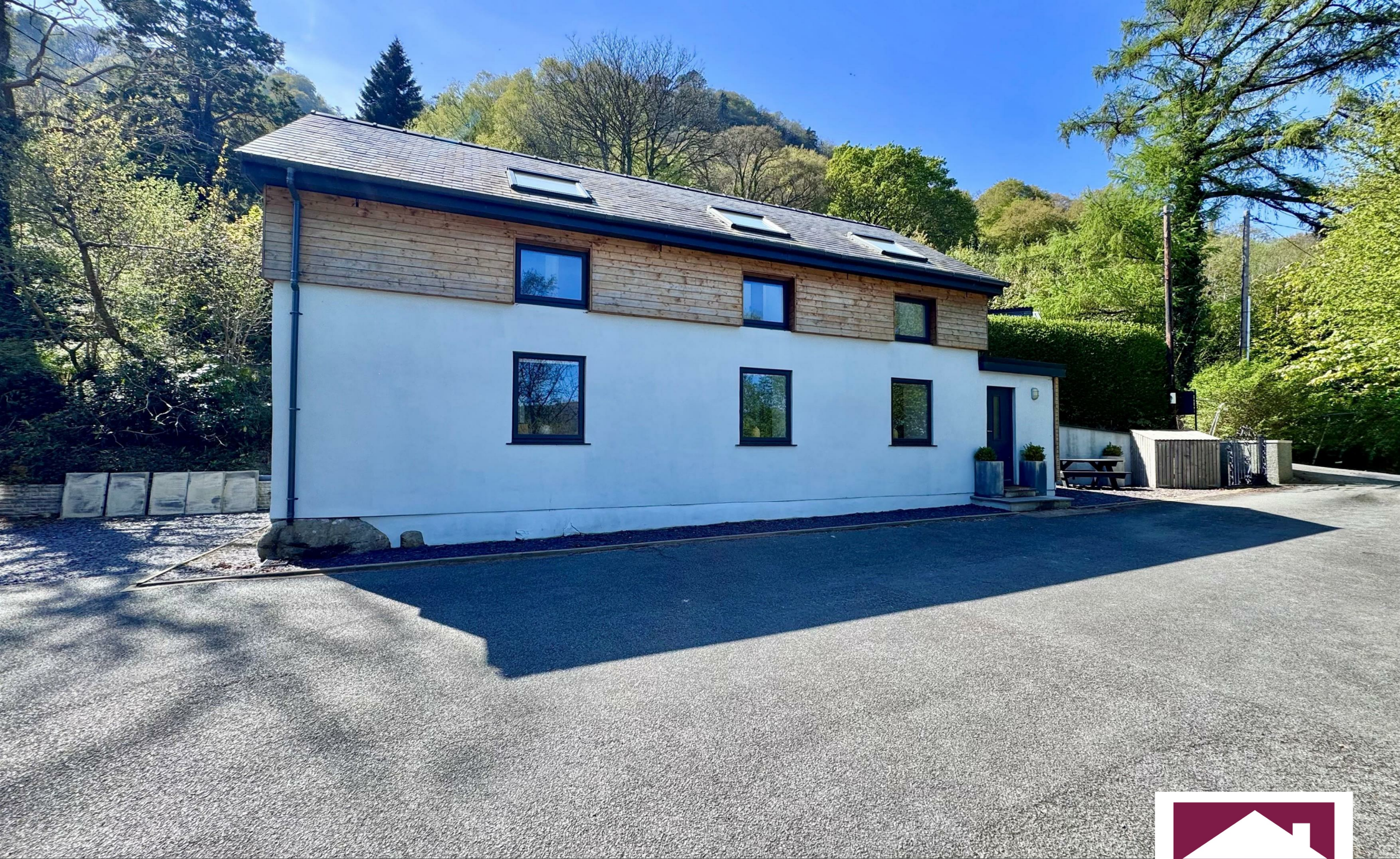
Pipeline Cottage Dolgarrog Conwy LL32 8JP