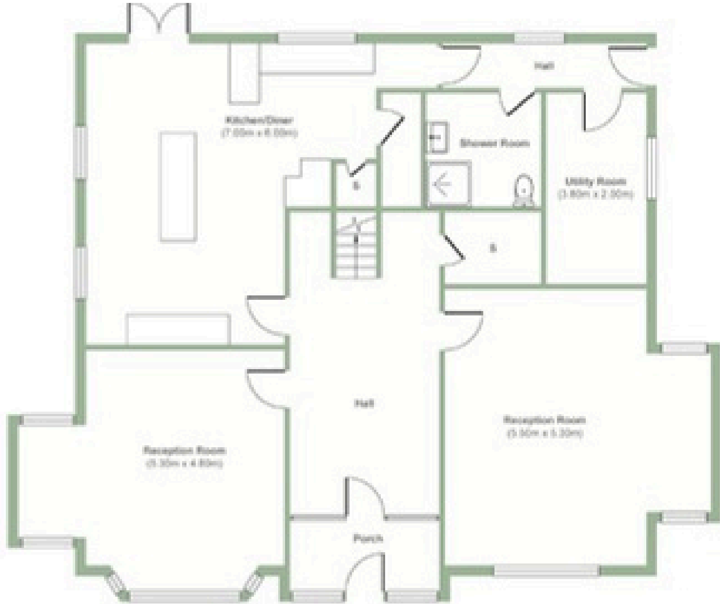
Ground Floor Approximate Floor Area (117.80 sq. m)