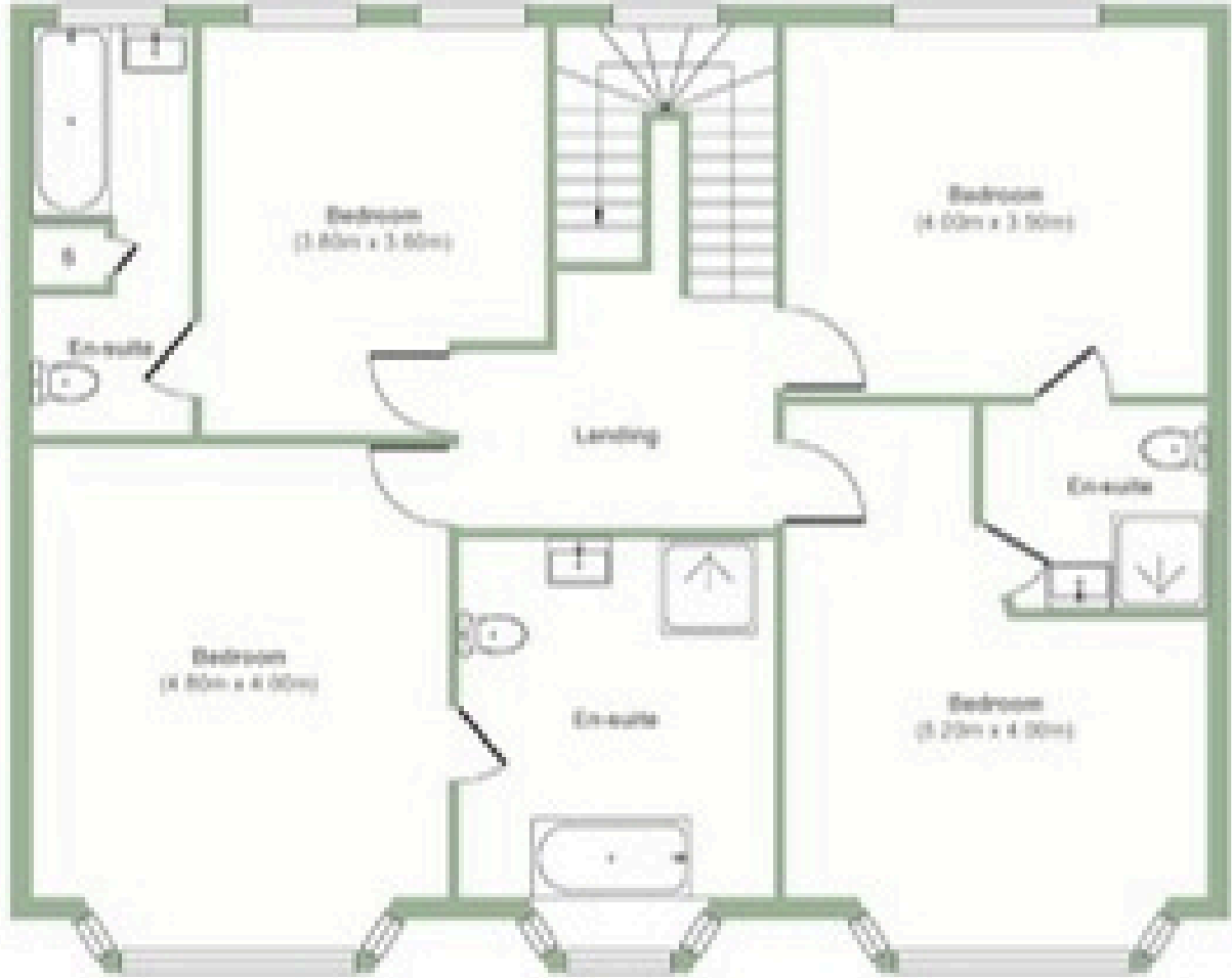
First Floor Approximate Floor Area (84.80 sq. m)