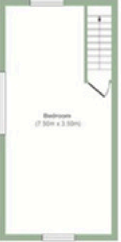
Area First Floor Approximate Floor Area (24.50 sq. m)

Approx. Gross Internal Floor Area 262.60 sq. m