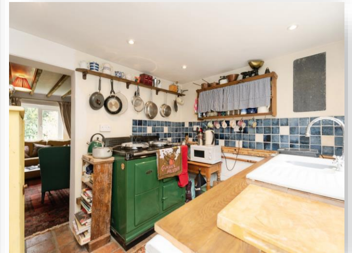
Great Yard, Saxthorpe Norwich NR11 7AH