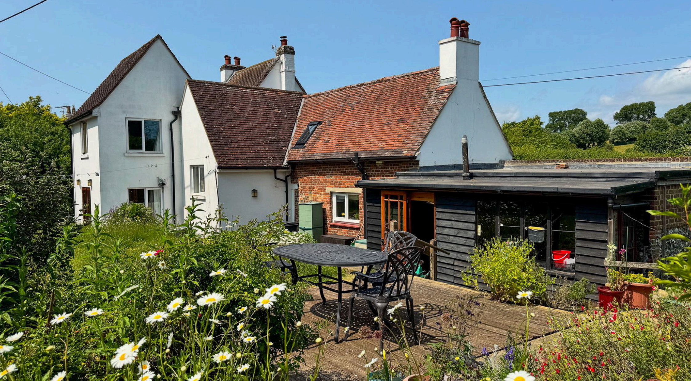
Forge Cottage, Forge Lane, Sutton