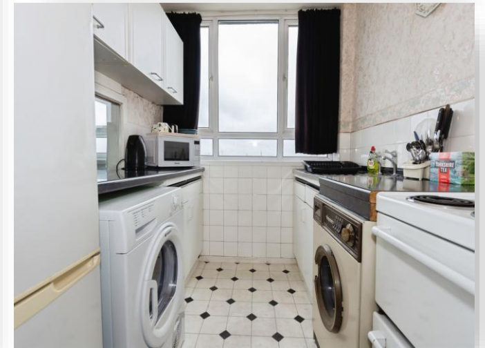
Elmwood Court Pershore Road, Birmingham B5 7PE