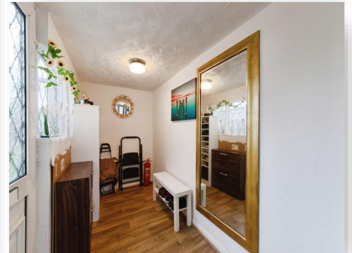
Louise Croft, Birmingham B14 5NY