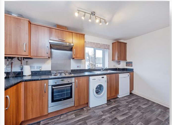
Douglas Walk, Broughton, Milton Keynes, MK10 7DF