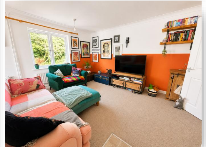
Thomas Grant Avenue, Gosport, PO12 1GB