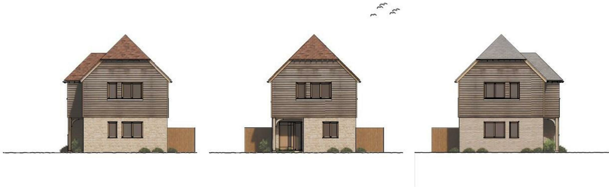
fig. 4.07 - Proposed elevations - plots 1-3