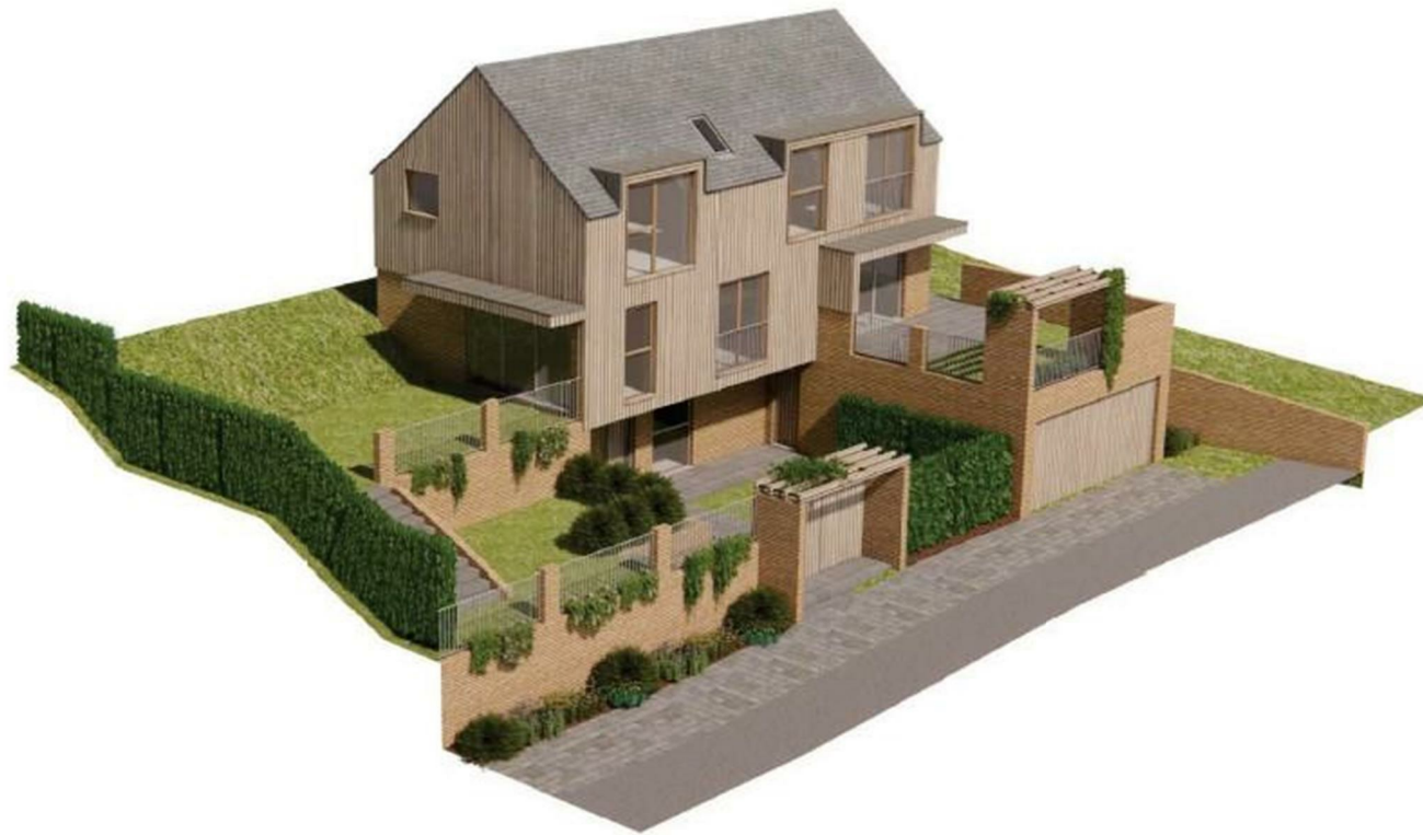
fig. 4.09 - Proposed 3D view - plot 4