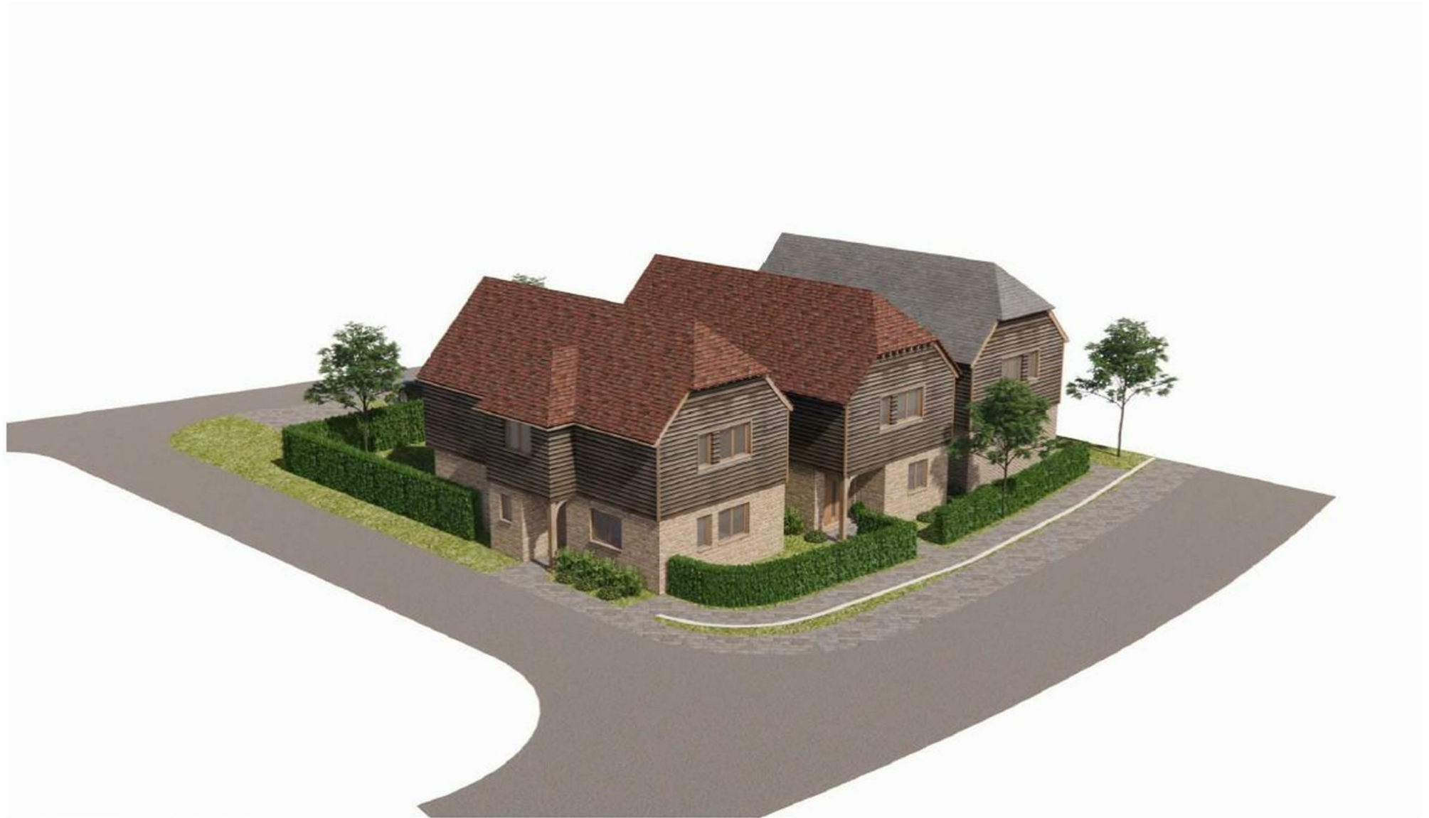
fig. 4.06 - Proposed 3D view - plots 1-3