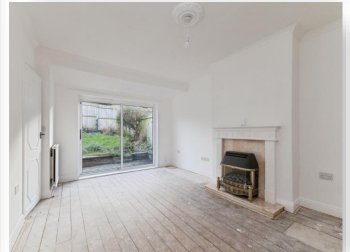
Brooksbank Road, Ormesby Middlesbrough TS7 9EQ