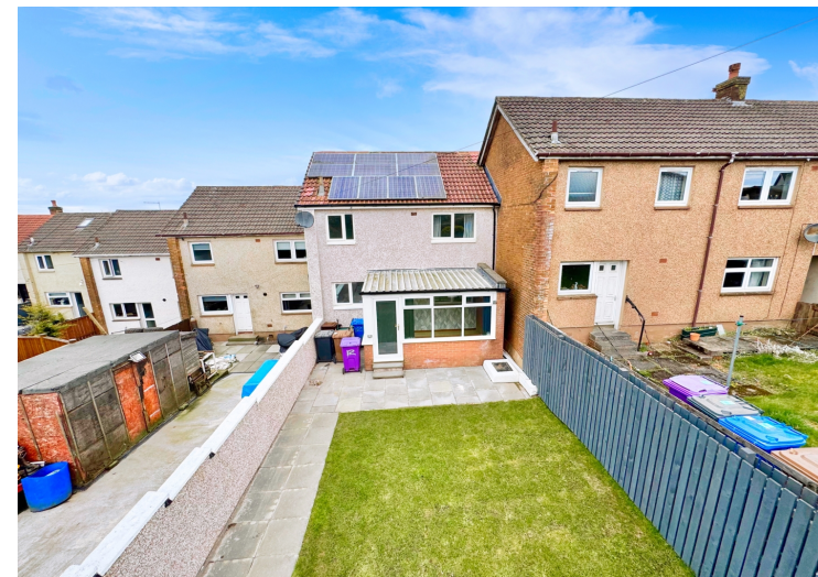
St. Inans Drive, Beith