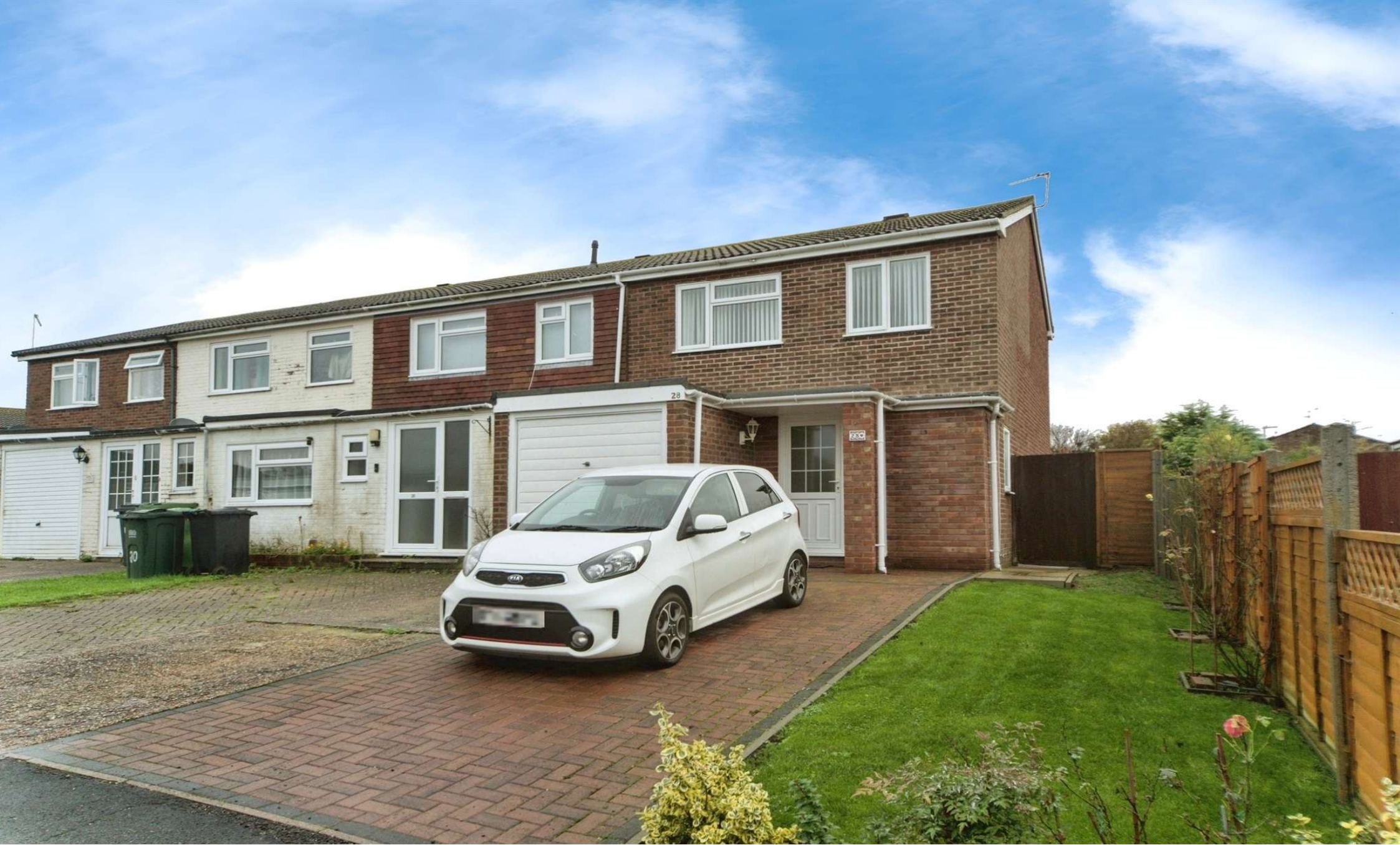
Briar Place, Eastbourne BN23 8DB