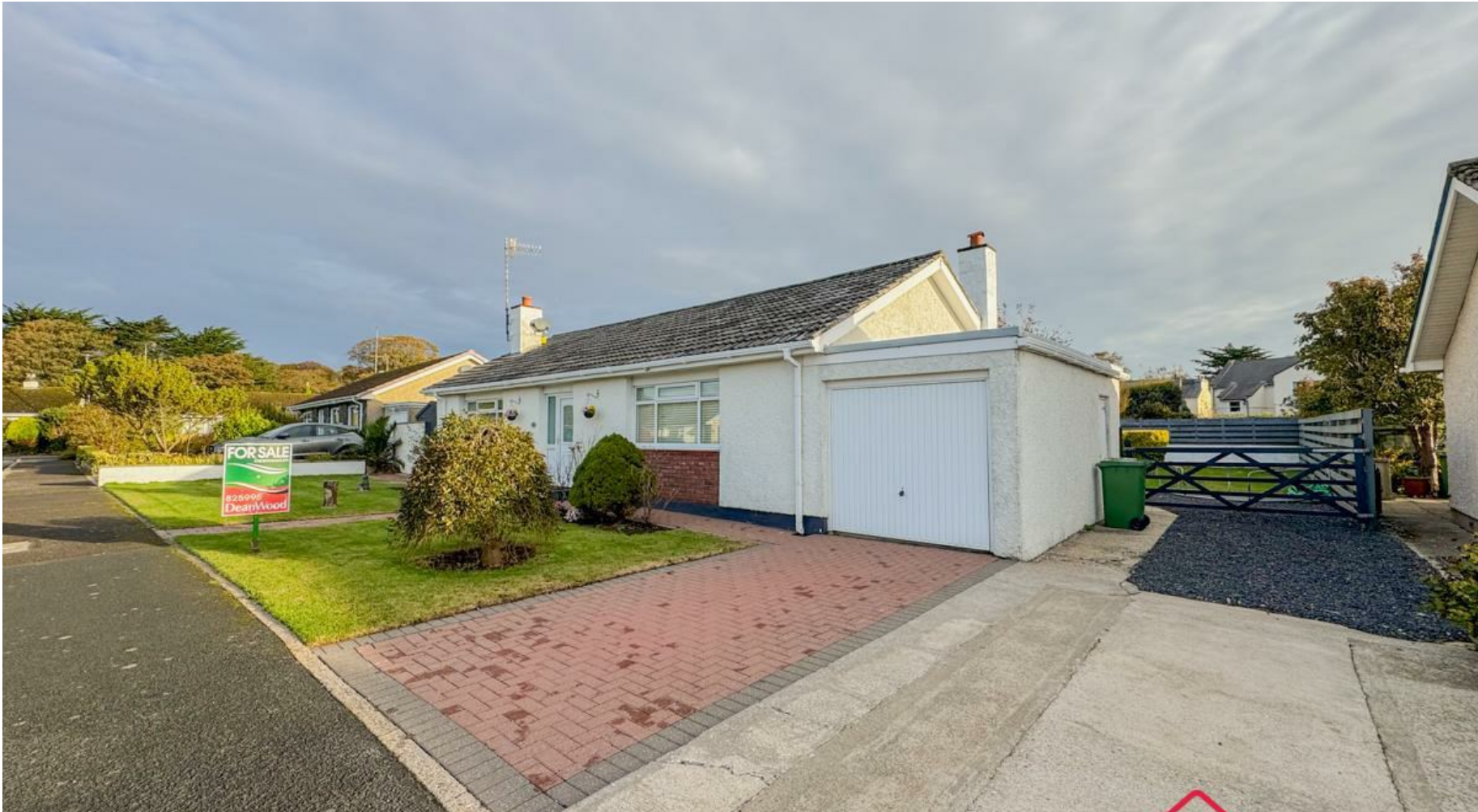
29 Silverburn Drive, Ballasalla, Isle of Man, IM9 2EF Asking Price £415,000