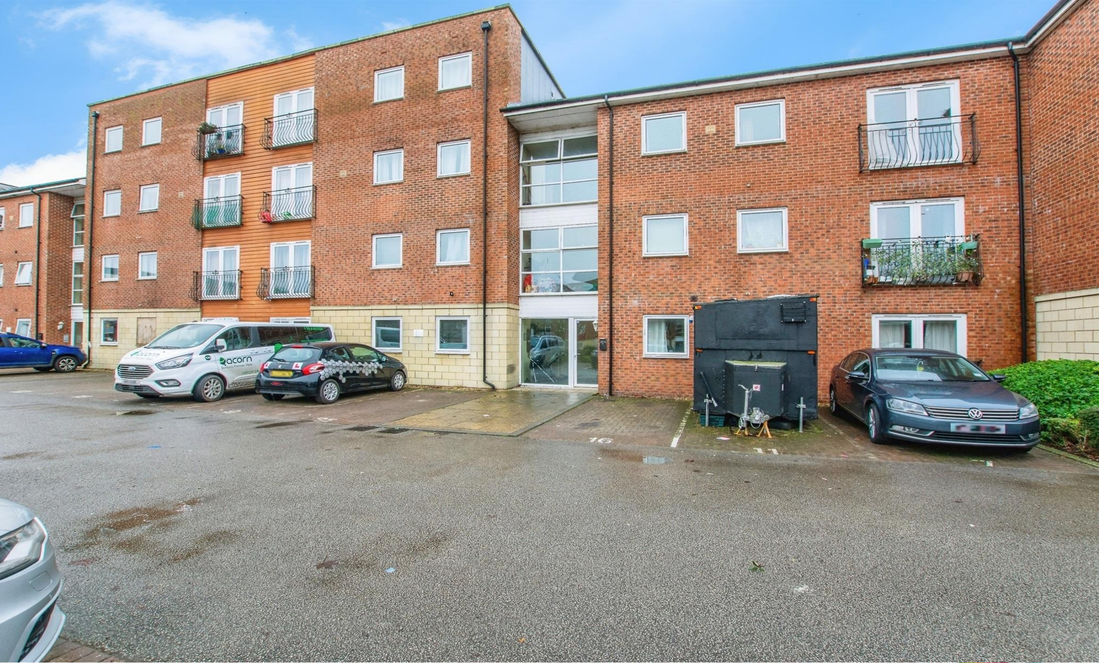
Sutton Terrace, Boston PE21 8GE